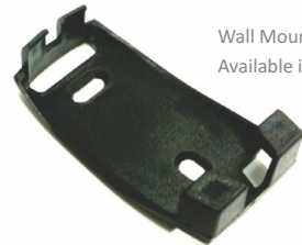
Wall Mount bracket WM Available in Black & White